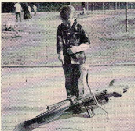
See article on left.